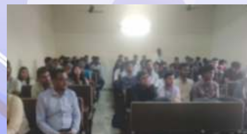
Glimpses of the Workshop