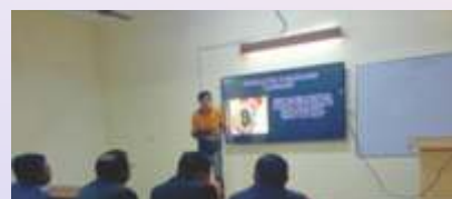
Glimpses of the Workshop