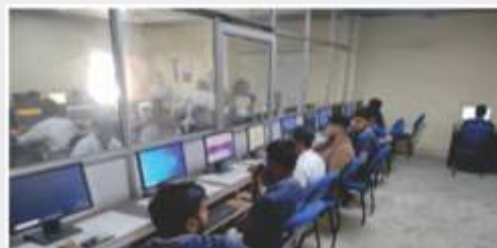
Glimpses of the Competition