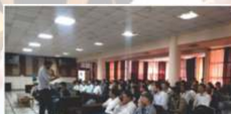
Glimpses of the Workshop