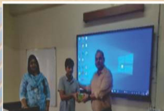
HOD, IT Felicitating the Alumnus